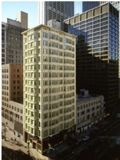
Burnham Hotel, Chicago. (Old Reliance Building)

We are slowly assembling Chicago images that we can use at the website and for other publicity. Please send any suggestions to Tom Leslie.