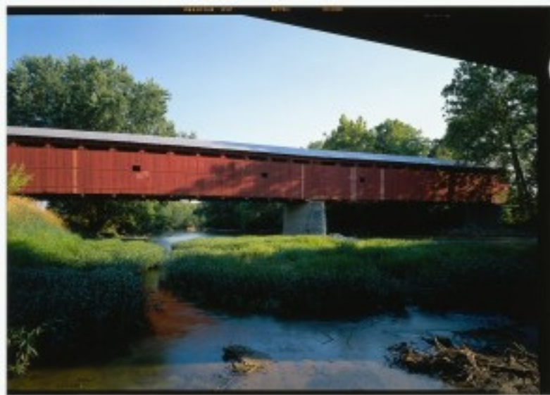
Eldean Bridge (Long Truss, 1860) in Miami County, will be on both Saturday tours.

The registration deadline is Wednesday, May 15, 2013.