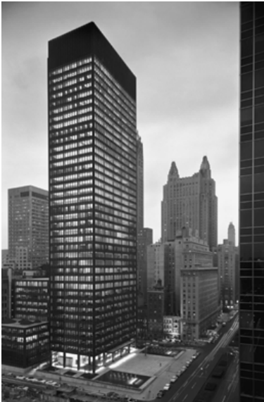
Seagram Building, 375 Park Avenue, New York, NY Completed 1957