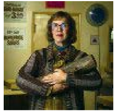
The Log Lady

House of Games is the first film directed by David Mamet (1987) who also wrote the screenplay. Lindsay Crouse and Joe Mantegna give magnetic performances and the plot twists and turns.