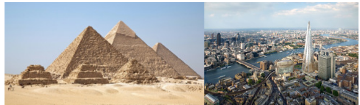
From the Pyramids to the Shard