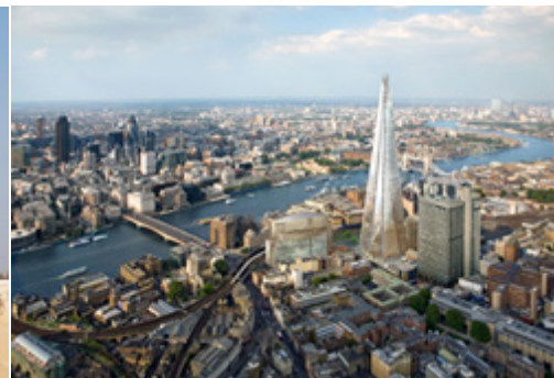
From the Pyramids to the Shard