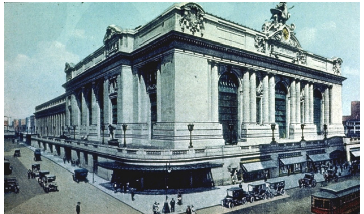
Grand Central Terminal 1913

by an engine’s boiler that ended inside a passenger car, but smoke in the tunnel was a probable cause of one engineer missing a stop signal. The New York City government moved to forbid the use of steam locomotives, adding to the railroads’ problems with their existing system.