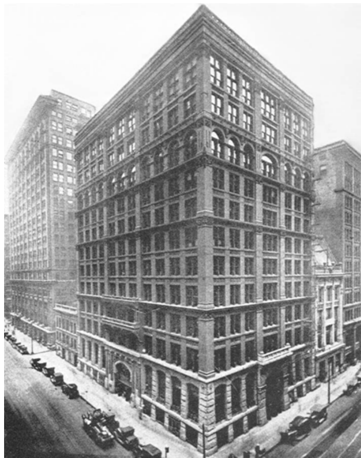
Home Insurance Building, Chicago, IL