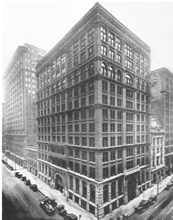
Home Insurance Building, Chicago, IL