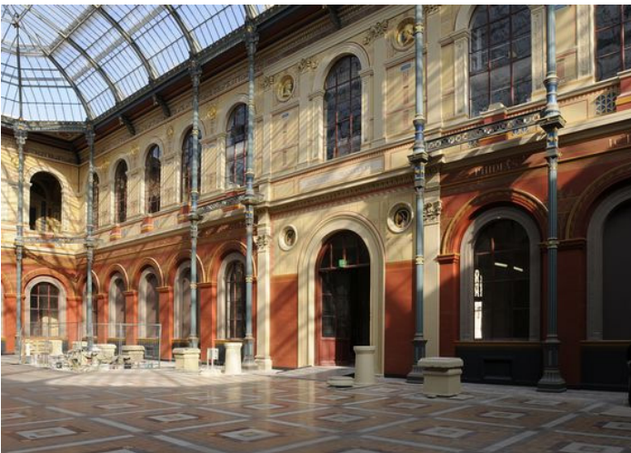
The magnificent Salon des Etudes of the Ecole des Beaux Arts served as HQ Central during most of the Congress

Thus the Paris program followed those of previous Congresses in covering a wide range of subjects which were collected by the organizers into 55 different classifications. Once again most of these dealt with 'objects' (buildings, bridges & infrastructure, materials, design issues, etc.) as distinct from subjects devoted to organization, economics, contracts, regulation and the like.