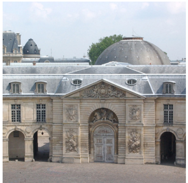
ENSA Versailles hosted some of the sessions. The school is housed in the Petite Ecurie or stables of the palace built in 1682

We await statistics on attendance, but the estimate was for 350 registered delegates representing many countries, with about 25 – 30 from the USA and close to an equal number from Central and South America. 237 papers were listed in the program which were delivered in groups assigned to 66 sessions with seven or eight being run concurrently giving a wide, but sometimes frustrating, set of choices.