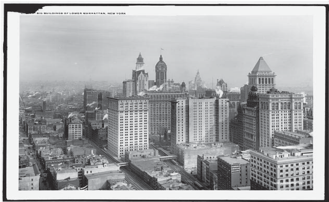
The Big Buildings of Lower Manhattan, Created/Published [between 1900-1920]

THE JULY NEWSLETTER WILL INCLUDE MORE INFORMATION ON THE PROGRAM AND HOW TO REGISTER.