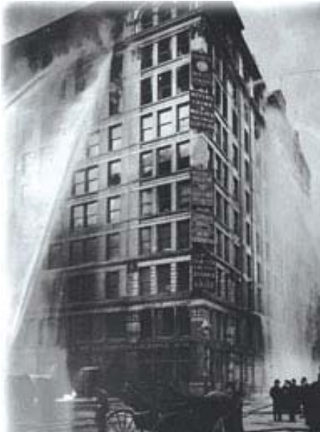
The Triangle Shirtwaist Fire 1911

One of the most well-known fires in American history took place on March 25, 1911 when the shop of the Triangle Shirtwaist Company burned, killing over 140 people. The shop occupied the eighth, ninth and tenth floors of the Asch Building, facing Washington Square in New York, and was considered to be of modern design: the iron and steel frame of the building was fire-proofed with terra cotta, and the building had two internal stairs and an exterior fire escape. While any fire of this magnitude would be both tragic and intensely studied for lessons about fire-protection, the prominent location of the building and the fact that many of the deaths resulted from people leaping from windows more than 100 feet above the sidewalk, ensured that this fire would be infamous.