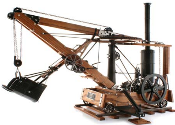
The First Steam Shovel

This machine had a fixed mast and swinging boom like that of a quarry derrick, with a bucket attached to the end of a dipper stick that was mounted to the boom. The boom was lowered to enable the bucket to dig in an arc through the cut face, then raised and swung to one side or the other to dump. The swinging and dumping were accomplished manually; a man on each side of the shovel hauled to on a rope to swing the boom back and forth, and the man on the dumping side tripped the bucket. The shovel was powered by a vertical boiler that drove a double-drum chain hoist, and the machine traveled on four railroad wheels. Otis patented an improved version of this shovel in 1839; while the improved machine was working in Massachusetts on its first project, Otis died of typhus at the age of 26.