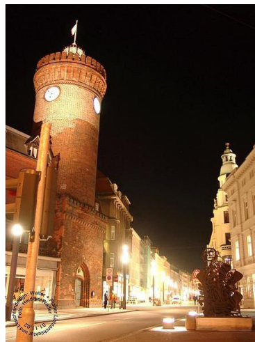
Spremberg Tower Cottbus