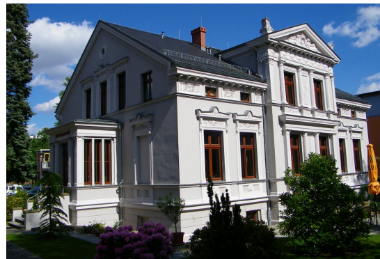
Most of the factories were built after the late 1870s. They were integrated into residential areas. In the early period, owners built their houses right next to their factories, and many examples of these high-style villas survive.

The loss of jobs has exacerbated a general population exodus from the region, following reunification. We learned that thousands of housing units have been demolished, but one could see many abandoned buildings still standing. This includes the fine textile mills. These former mills seem ideal for adaptive reuse: they are of moderate size with lots of windows, are integrated in residential areas and architecturally attractive. But Cottbus is struggling to revive its economic base. Whether the mill buildings will survive until they can be rehabilitated is a question.