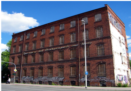
Cottbus textile factory; woollen fabrics were the main product, but the town also manufactured apparel.

In a speech before a concert, one of the events in the Construction History Congress program, the presenter explained that the 1908 concert hall (Staatstheater Cottbus) in which we were seated was built in a period of prosperity in Cottbus, due in large measure to the city's textile industry. What sort of textiles, I wondered, and where were the mills located? Were any still standing? No one could tell me anything about the industry, except where some of the mills were located. So one afternoon I went in search of textile mills.